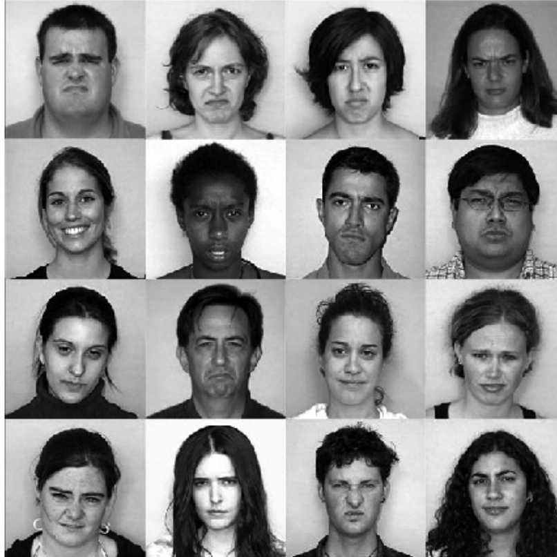
FIGURE 1. Matrix presented to participants in the experimental training condition.

rather than at the beginning of every trial. The experimenter was present in the room only to set up the microphone and administer the practice trials and then left the participants to complete the experimental trials alone. The participants' voice responses were recorded and later checked for errors.